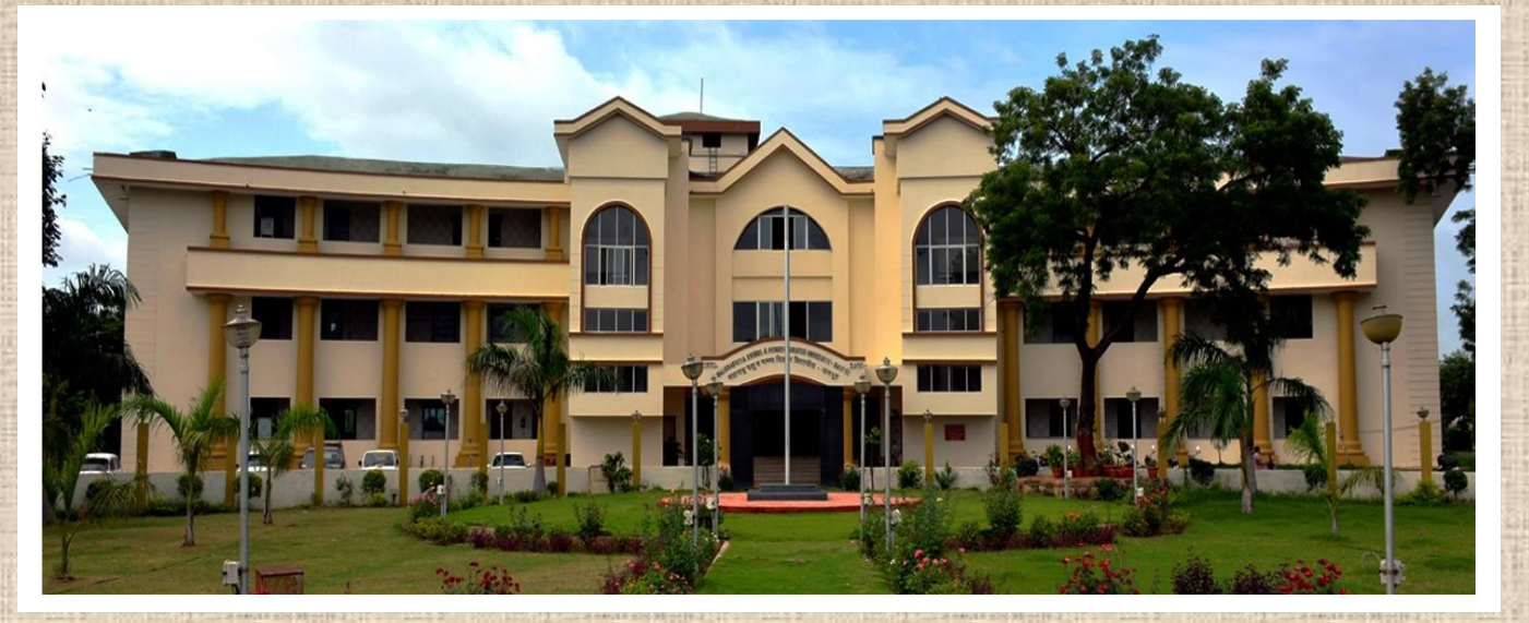
Maharashtra Animal & Fishery Sciences University Futala Lake Road, Nagpur - 440 001